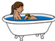
Take A Bath